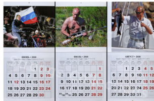
The months show 'Vlad the lad' in a number of scenarios.

But when the BBC contacted 10 of the biggest retailers, no one was selling it. And it only seems to be available online through eBay and Amazon with only a couple of hundred sold. That said, the story gained column inches in the Daily Mail, The Sun, the Mirror, Newsweek, who told their readers that the title offered the chance to see the Russian president hunting topless and cuddling kittens!