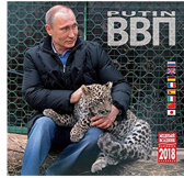
Putin's 2018 calendar hasn't quite been the hot seller as reported in Russian media.

In a very strange bit of #fakenews, British media covered a story about the Russian media (bear with us here...) covering the story of the success in the UK of Vladimir Putin's 2018 calendar. Only problem seems to be that it hasn't been a success over here.