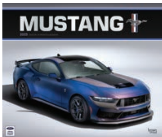
978-1-9754-7940-4 (Foil Cover)