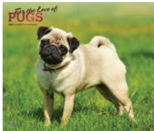
978-1-9754-7307-5 (Foil Cover)