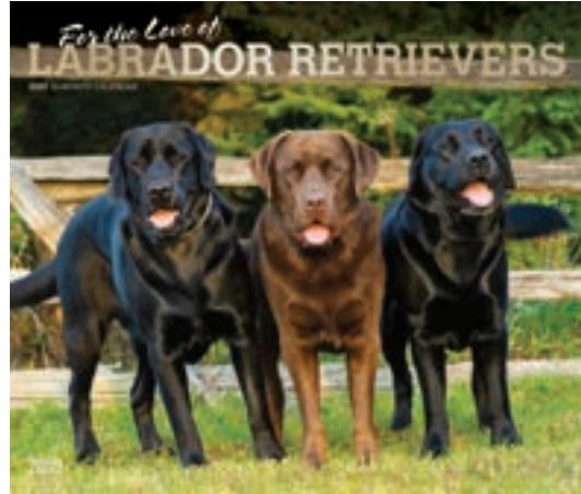
978-1-9754-7306-8 (Foil Cover)