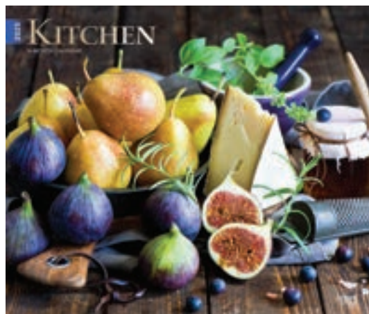
978-1-9754-7305-1 (Foil Cover)