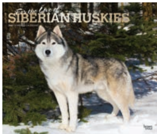
978-1-9754-7308-2 (Foil Cover)