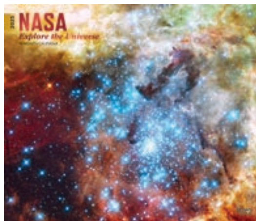
978-1-9754-7310-5 (Foil Cover)