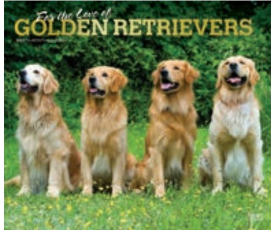
978-1-9754-7304-4 (Foil Cover)