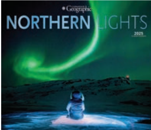
978-1-5256-1450-7 (Foil Cover)