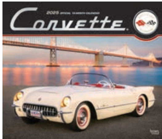
978-1-9754-7941-1 (Foil Cover)