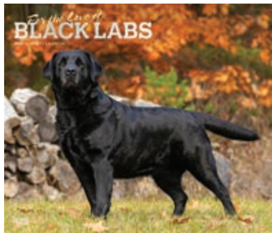
978-1-9754-8172-8 (Foil Cover)