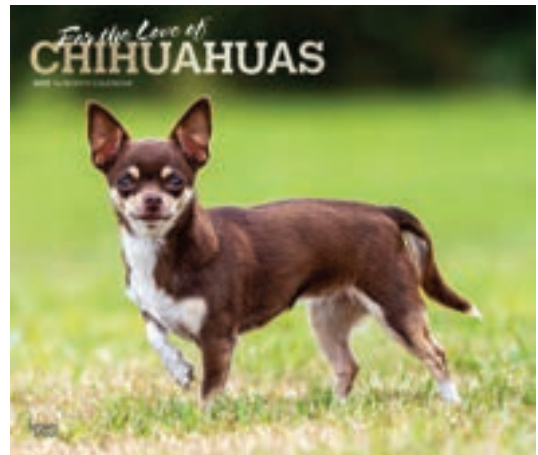
978-1-9754-8171-1 (Foil Cover)