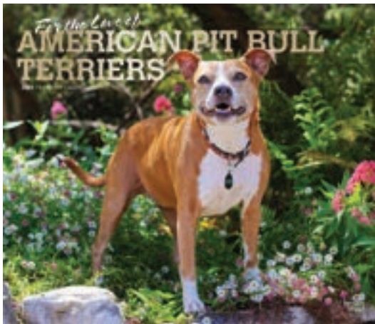
978-1-9754-7298-6 (Foil Cover)