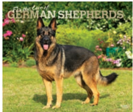
978-1-9754-7303-7 (Foil Cover)