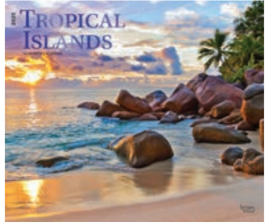
978-1-9754-7311-2 (Foil Cover)