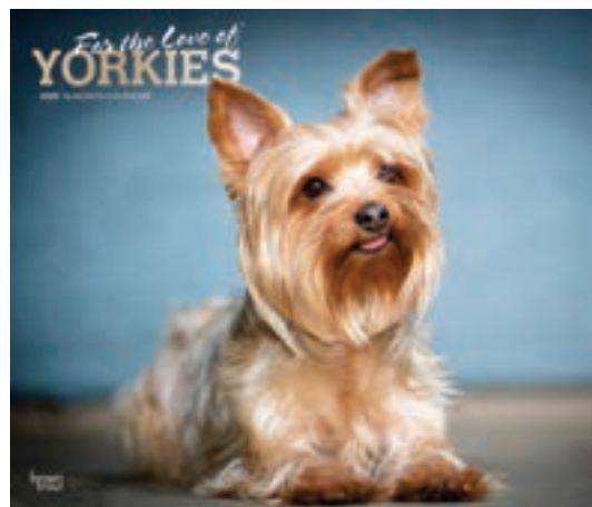
978-1-9754-7309-9 (Foil Cover)