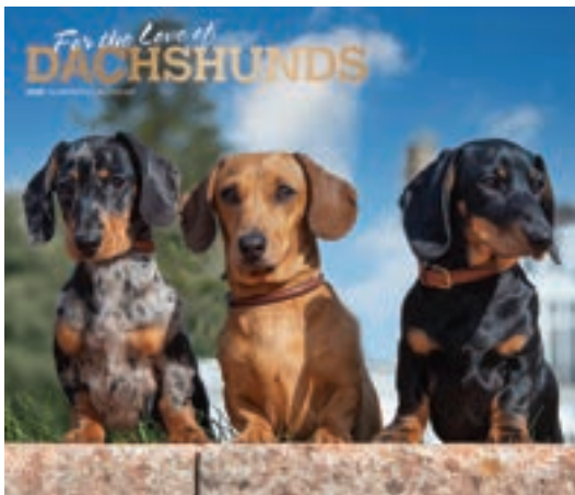
978-1-9754-7302-0 (Foil Cover)