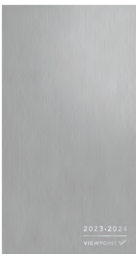
978-1-9754-5491-3 (Foil Cover)