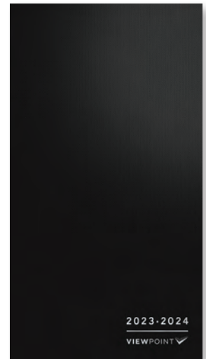
978-1-9754-5490-6 (Foil Cover)