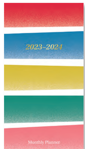
978-1-9754-4836-3 (Foil Cover)