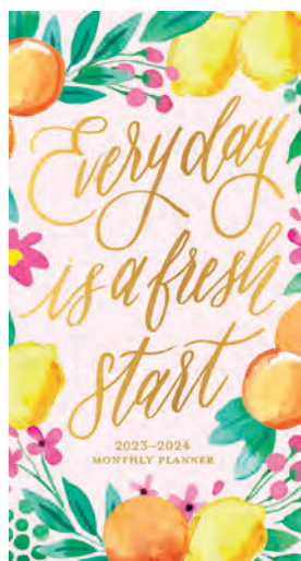
978-1-9754-4967-4 (Foil Cover)