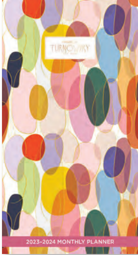
978-1-9754-5013-7 (Foil Cover)