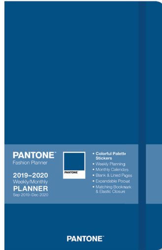
Dark Blue 9781975412777