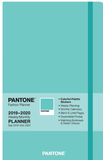
Glacier Blue 9781975412791