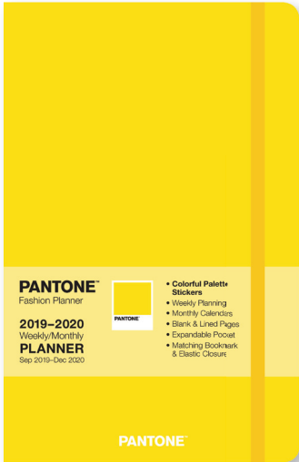
Lemon Yellow 9781975412746

2019 COLOR OF THE YEAR TO BE ANNOUNCED IN DECEMBER 2018!