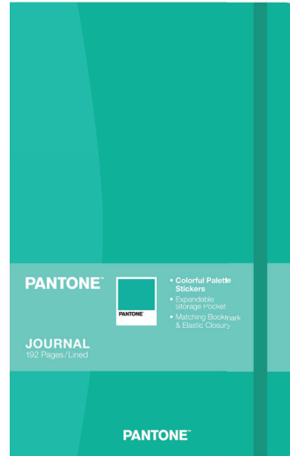
Light Turquoise 9781975412913