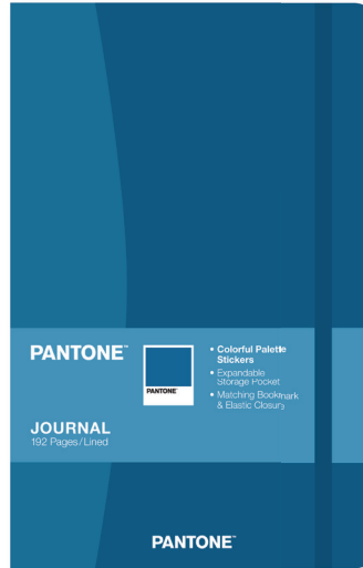
Topaz Blue 9781975412920