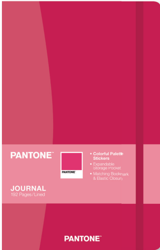
Ruby Red 9781975412937

2019 COLOR OF THE YEAR TO BE ANNOUNCED IN DECEMBER 2018!